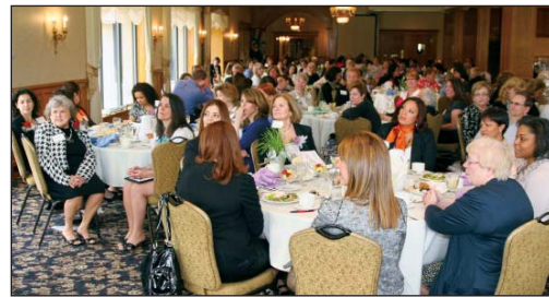
A lively shot of the luncheon with a few of our Honoree tables in view.