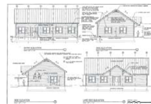
Schematic drawing of new Cabin

It's been over a year since an arsonist destroyed the Main Cabin at Camp Y-Wood, and we are pleased to share that construction is now underway! The new cabin will truly enhance opportunities for our youth. We had originally intended that the building be available for camp sessions this year. However, in planning for the new building, we opted to almost triple its size, insulate the building and provide indoor bathrooms [a first at the camp!]. These enhancements will provide an inviting, central meeting place, especially during inclement weather, and will make the cabin available in fall and spring for OST [out of school time] and weekend youth activities. The increased cabin size and plumbing necessitated a septic system, which added costs and required obtaining state permits. After another successful camp summer session, construction is now underway, with the main work scheduled for completion this fall, with finish work to be completed in the spring.