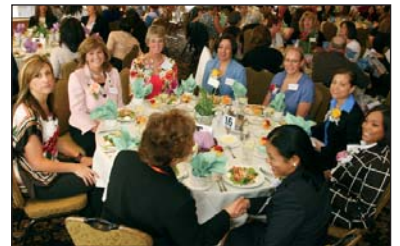
From our Tribute to Women Event!