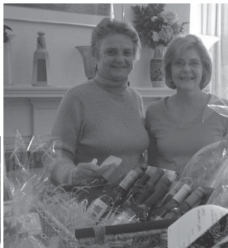
Let the fun begin! Guests enjoy the wine samplings!